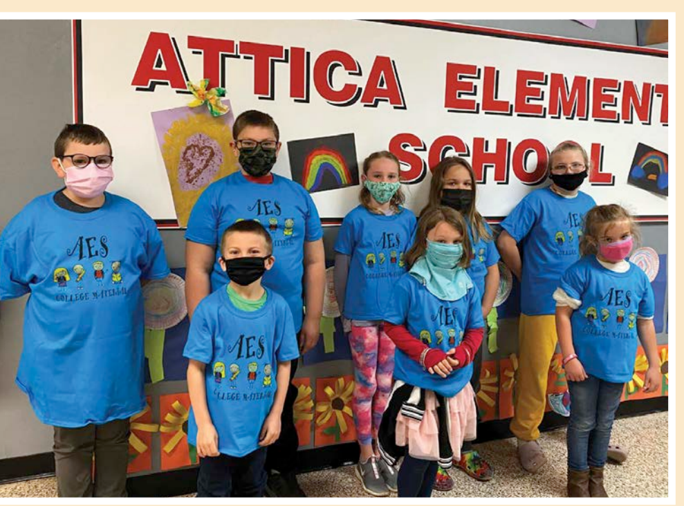
First students to enroll in the Promise Indiana Attica program

For questions about enrollment call: 765-762-7000, ext. 5000.